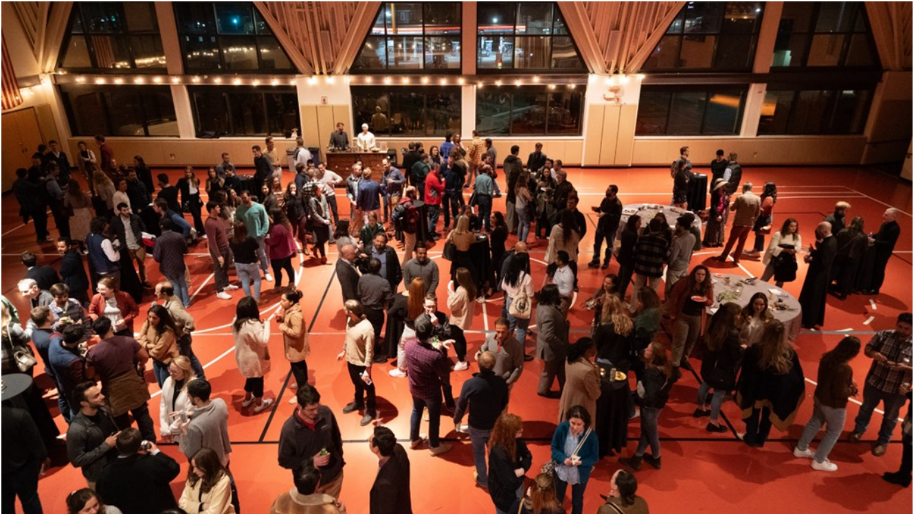
Pub time with Bishop Burbidge during the 10 th anniversary celebration of "P3" (Prayer, Penance & Pub)